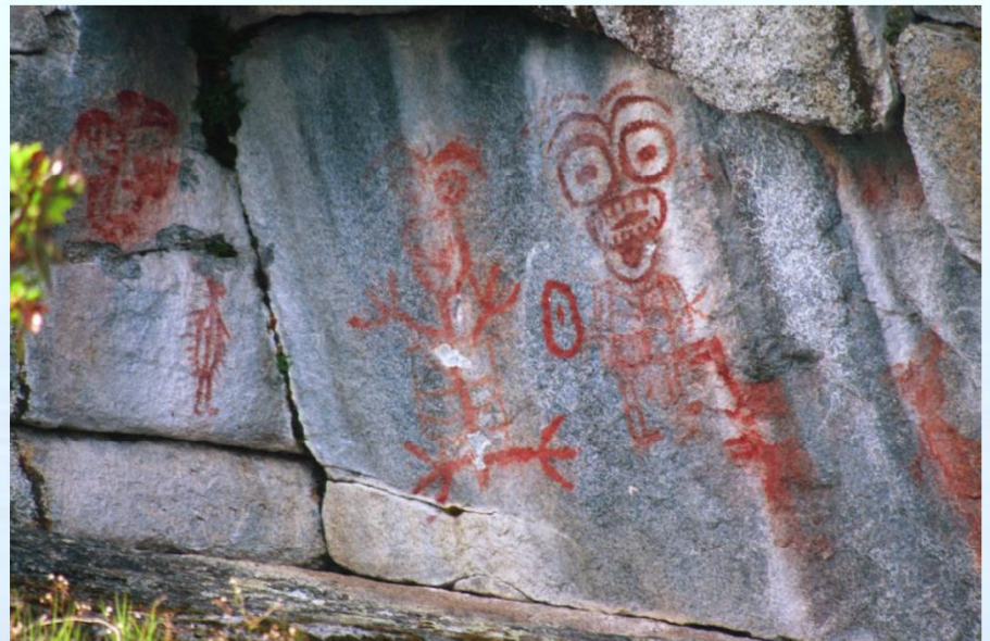
Pitt Lake Pictographs

We kindly ask that everyone who wants to join, even if by their own boat, please RSVP by Tuesday, September 26 th . Please contact Roma at roma@katzie.ca or call 778-227-2751 to RSVP or if you have any questions.